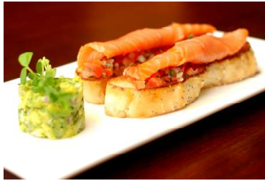
smoked salmon bruschetta